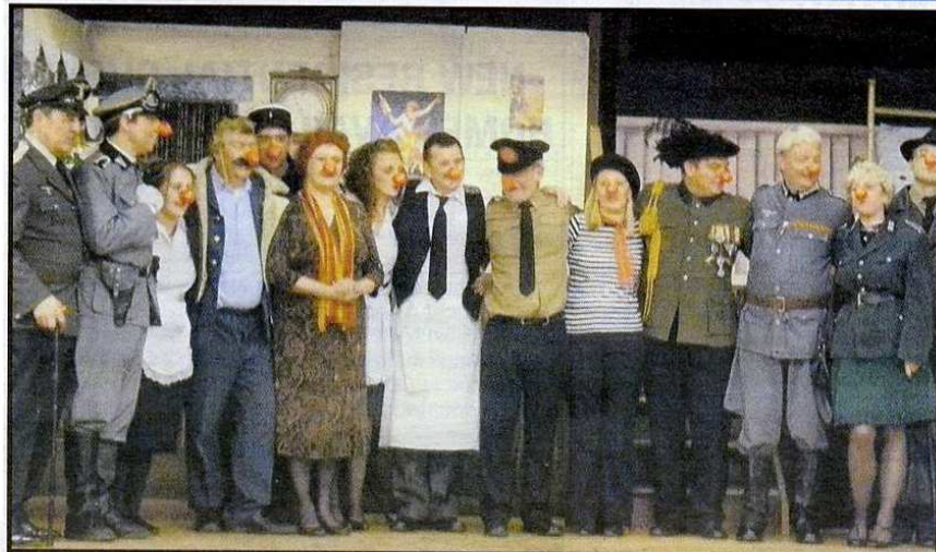
ON STAGE: The cast of the show.